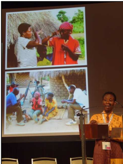
Deaf Link Uganda – Eastern: Sharing experiences working with rural deaf communities.

My special thanks and gratitude goes to Gallaudet University for their generosity in sponsoring my Keynote address and enabling my participation in a Congress that gave Developing Countries opportunities to effectively contribute throughout.