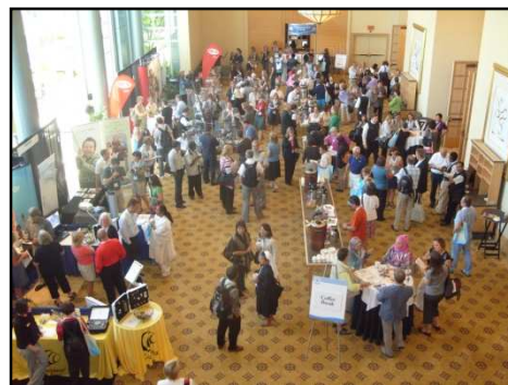
ICED participants interact and network during coffee break.